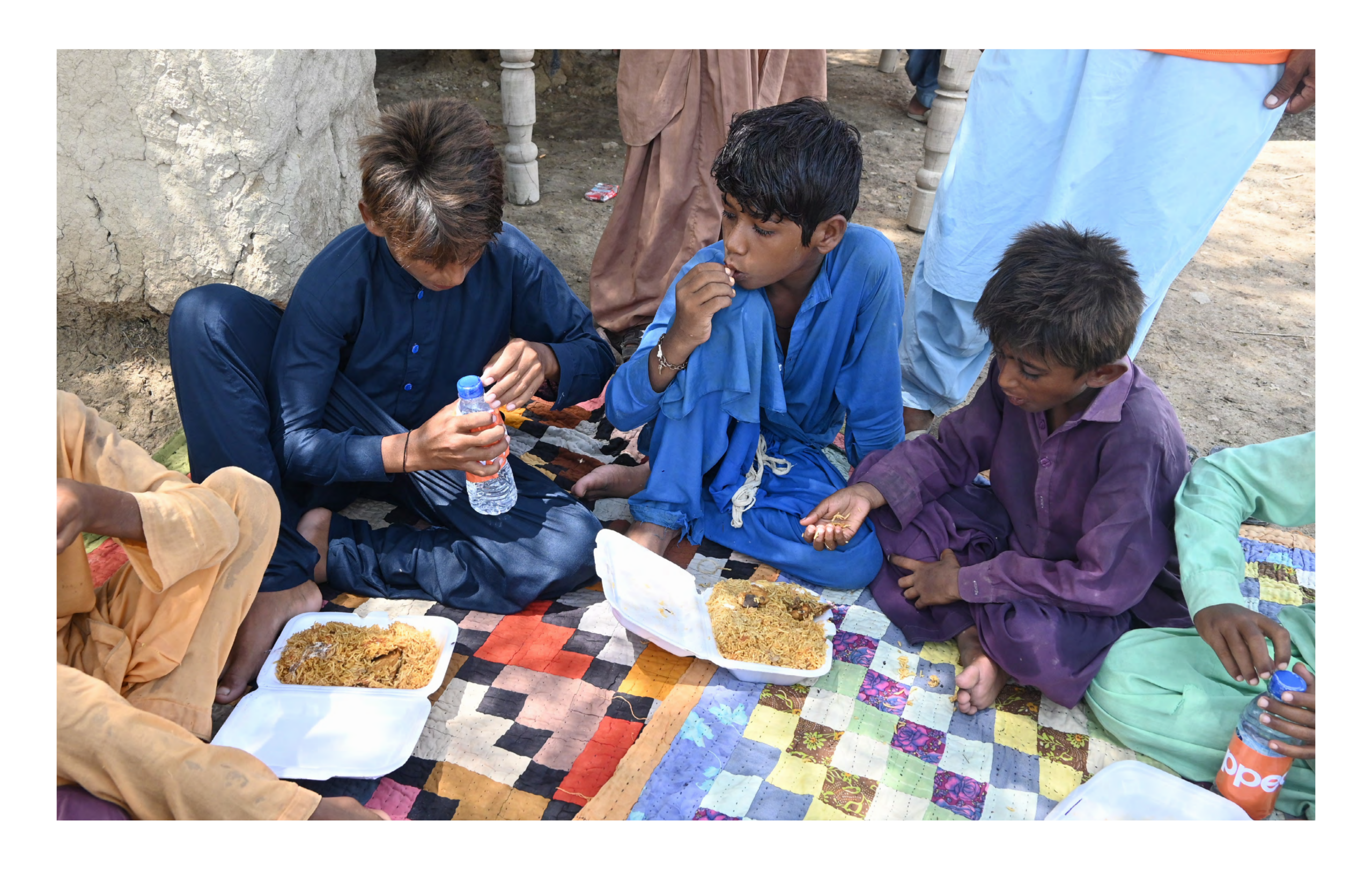
Provide food to over 36,000 INDIVIDUALS