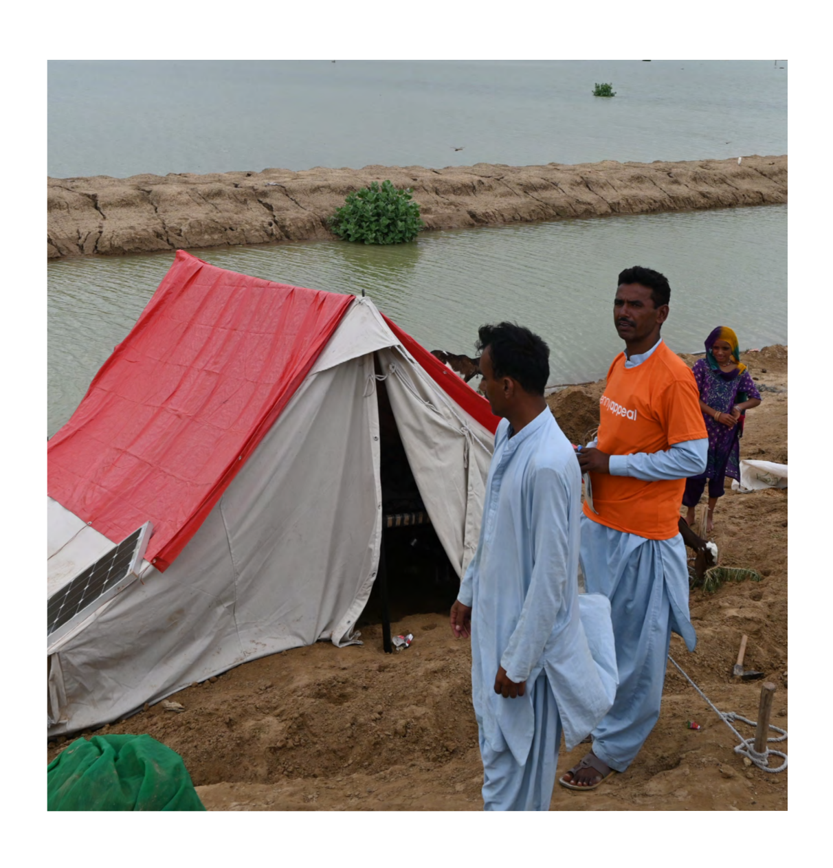
Provide OVER 1,000 SHELTERS.

Each offering refuge to an entire family