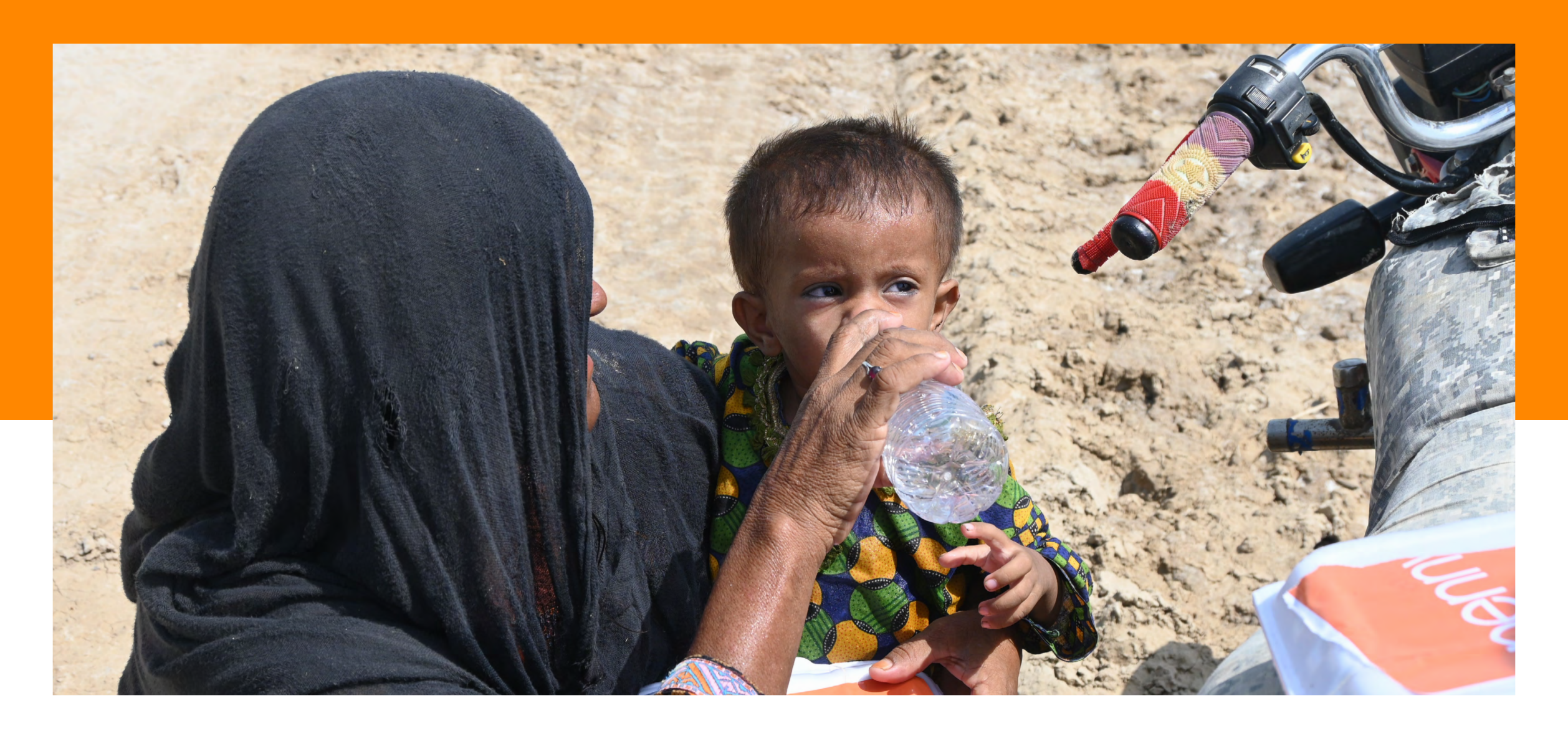
Supply over 170,000 LITRES of clean drinking water

We are currently working across 13 districts within Pakistan and doing all we can to support those suffering. So far, we have helped: